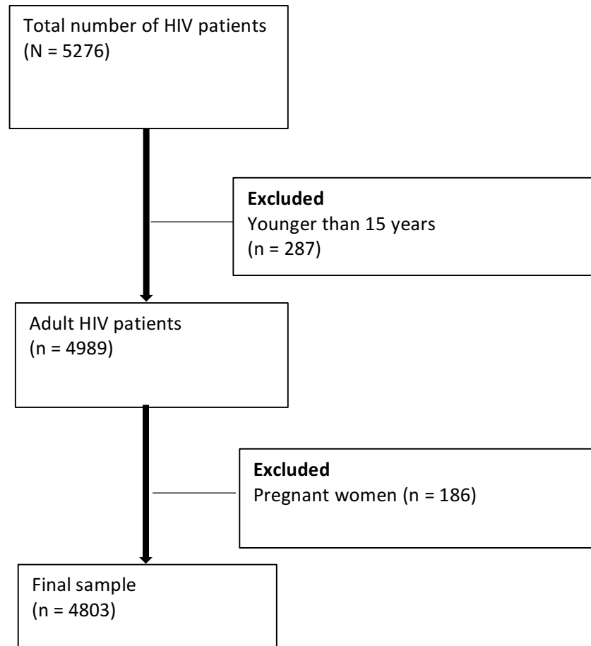
Figure 1. Exclusion Criteria